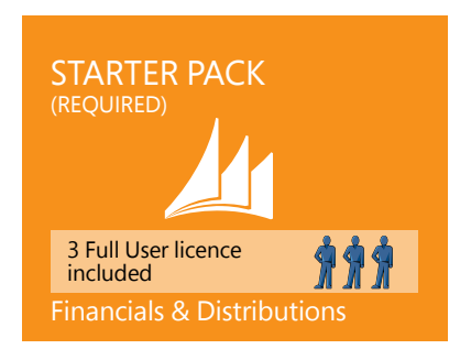
Figure 3: Starter Pack

A customer needs to license one Starter Pack per ERP Solution deployment. For many customers, this is the only Microsoft Dynamics license component they will need.