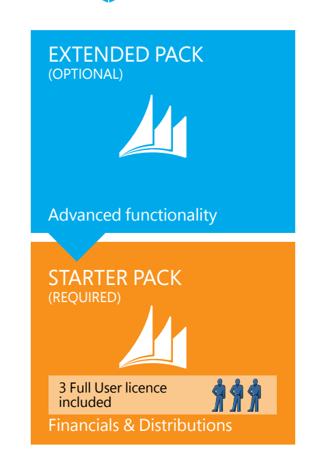
Figure 3: Extended Pack

The first three Full Users included in the Start Pack get to access to all of the incremental functionality.